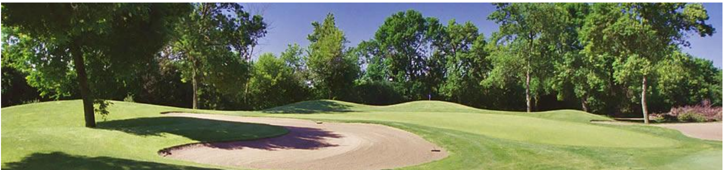
Gleneagles Country Club - Lemont