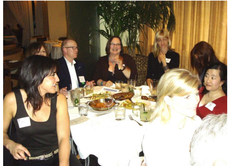
Members applaud the Award recipients